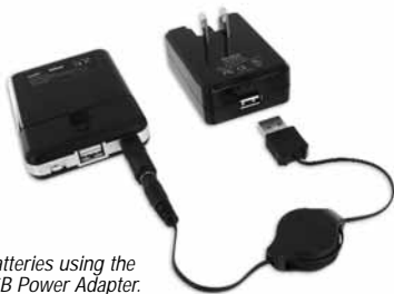
Charging batteries using the Tekkeon USB Power Adapter.